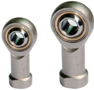
Table for universal joint and cylinder